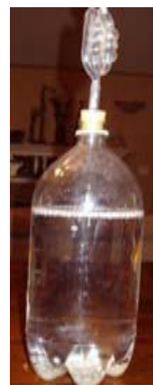
Microbial Lava Lamp