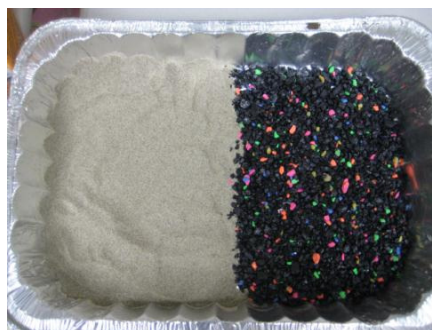
Step 2: Add sand and rocks to each side.