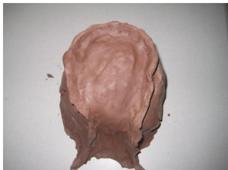
Step 1: Create a clay mountain with a river or stream.