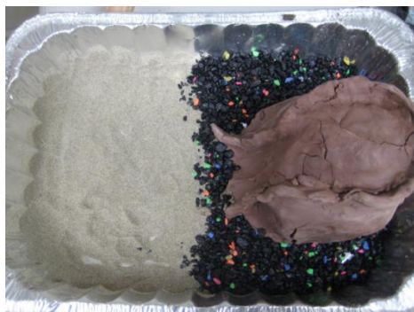
Step 3: Add dried mountain on top of the rocks.