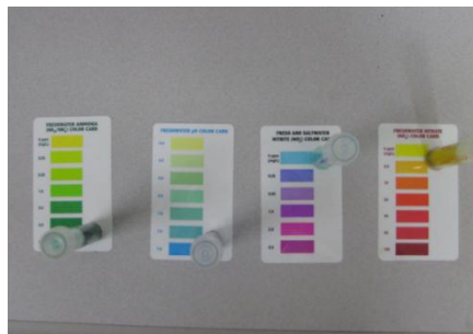
Step 4: Test the distilled water sample using a test kit for the initial, unpolluted conditions.