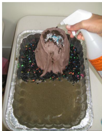
Step 6: Spray distilled water over the mountain area 100 times.