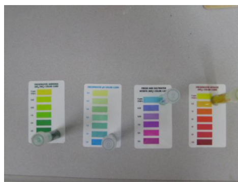
Step 8: Test the polluted water using a test kit.

Cleanup: Students should put the clay in the plastic bag and seal it so that it does not dry out. This will allow the clay to be reused in the next class. Collect the sand in a common bucket or bin for reuse. Collect the small rocks in a separate bucket/bin for reuse. Save as much as you can in each bin that is not commingled. Collect the commingled items (sand mixed with rocks, the water mixed with fertilizer) in a separate container. These items can safely be poured over several plants that may appreciate the food. Heavily dilute water testing kit results with tap water before pouring down a sink.