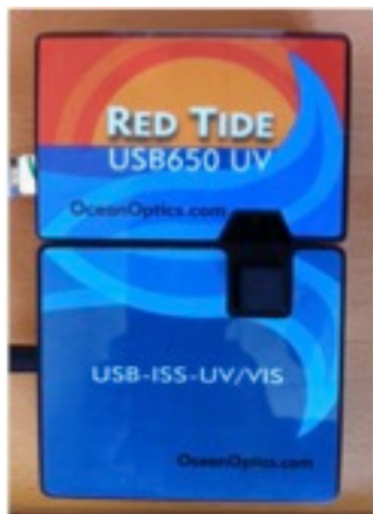
Figure 1: Red Tide USB650 optical bench attached to a USB-ISS-UV-VIS light source and cuvette holder from OceanOptics.

The energy of the excited state is quantized and the energy required to excite an electron from the valence band to the lowest conduction state is given by equation (1) below: