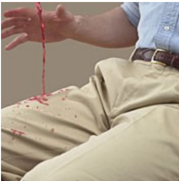
Stain-free fabric NanoTex®