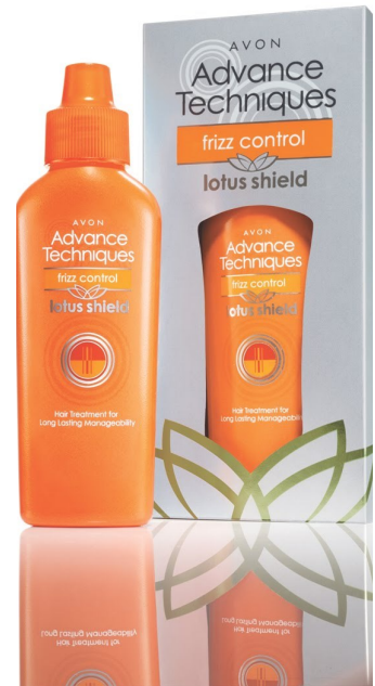
Copyright Agreement ©2012 Avon Products, Inc.